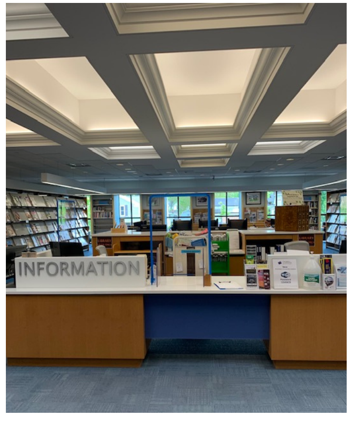
Information Desk- 1st Floor